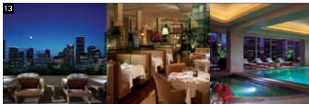
13 Hilton Americas–Houston, the Conference Headquarters Hotel

BEYOND THE AWESOME BENEFITS OF AN NACBA NATIONAL CONFERENCE, THERE ARE THOUSANDS OF REASONS TO PLUG INTO HOUSTON.